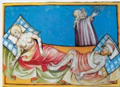
People infected with the Black Death

The Black Death was the name people gave to a disease called Bubonic Plague. Bubonic Plague was spread by fleas that lived on rats. The fleas jumped from rats onto people. When the fleas bit people, they transferred the virus that caused Bubonic Plague. Bubonic Plague spread easily in Europe's overcrowded and unhygienic cities of the 1350s. Bubonic Plague gave people sores all over their bodies. They also had high temperatures; they vomited blood and their fingers and toes turned black. Most infected people died within one week.